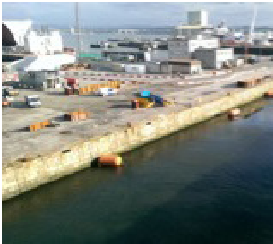
Fig. 4 Quay side made up of stone (circa 1909)