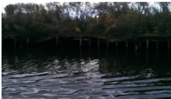
Fig. 7 Neglected timber pilings