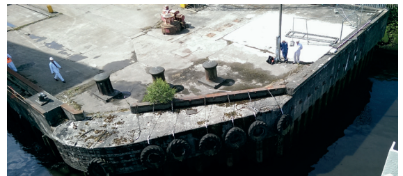
Fig. 3 Quay side made up of Concrete cap with steel piles