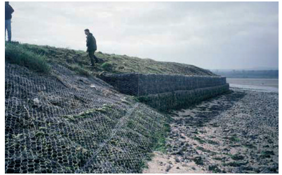
Fig 5 Different methods of gabion use