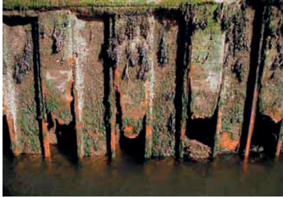
Fig. 2 Steel Quay with severe ALWC